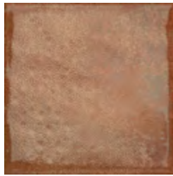
5.7x5.7 GLOSSY PRESSED #202812E