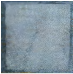
5.7x5.7 GLOSSY PRESSED #202710E