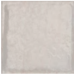
5.7x5.7 GLOSSY PRESSED #202708E