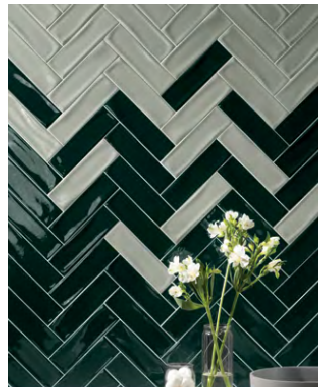
Sauge | Pin