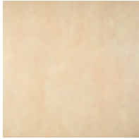
Oh!Take Home | V2

48x48 NAT RECT | #200686E * 24x48 NAT RECT | #201988E * 12x24 NAT BOLD | #79963ET