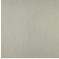
Oh!Take Forest | V2

48x48 NAT RECT | #200688E * 24x48 NAT RECT | #201986E * 12x24 NAT BOLD | #79961ET