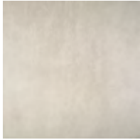
Oh!Take Mountain | V2

63x63 NAT RECT | #203267E * 48x48 NAT RECT | #200330E * 24x48 NAT RECT | #201990E 12x24 NAT BOLD | #79965ET