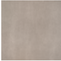
Oh!Take Moon | V2

63x63 NAT RECT | #203265E * 48x48 NAT RECT | #200326E * 24x48 NAT RECT | #201989E 12x24 NAT BOLD | #79964ET