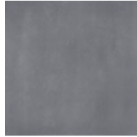
Oh!Take Heaven | V2

48x48 NAT RECT | #200685E * 24x48 NAT RECT | #201987E 12x24 NAT BOLD | #79962ET