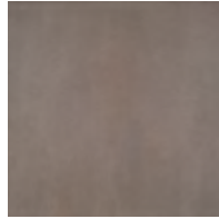
Oh!Take City | V2

63x63 NAT RECT | #203263E * 48x48 NAT RECT | #200328E * 24x48 NAT RECT | #201984E 12x24 NAT BOLD | #79959ET